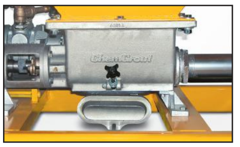
Easy access clean-out port.

This simple, easy to use system is complete and ready for jobsite operation. The mix tank is equipped with bag breaker, baffles and a variable speed highefficiency paddle that provides high shearing action for thorough and complete particle wetting. The tank outlet valve is a large slide gate that allows the thickest materials to fall easily into the pump