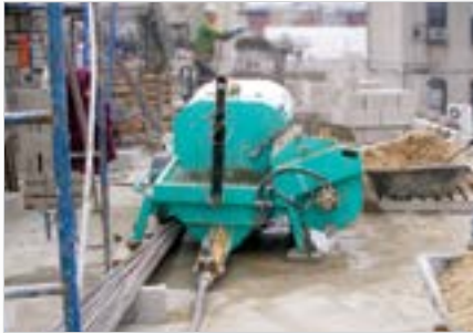
Concrete block walls are being filled with the Silent 300 which is shown with the optional larger 60.12 rotor/stator. Notice the grout is being made the old time way – shovels of sand and some portland.

"Whether it was a Silent 300 Prestige that we rented, or one that we sold, these pumps have performed very well. The Silent 300 Prestige is reliable and versatile. We have seen them used for pumping repair grout a long distance, and for spraying repair mortars that usually can only be applied by hand. This system also works real well for block filling, just position it under a silo and get going. For the coming year we are adding a couple more units to our rental fleet. You know a piece of equipment is a winner when it comes off a rental and the contractor returning it asks, "what would it cost me to buy this pump?", and usually they do".