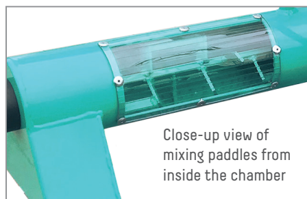
Close-up view of mixing paddles from inside the chamber

✓ Oversized solid rubber wheels (14.5" x 2.5") for easier transport even on rough terrain